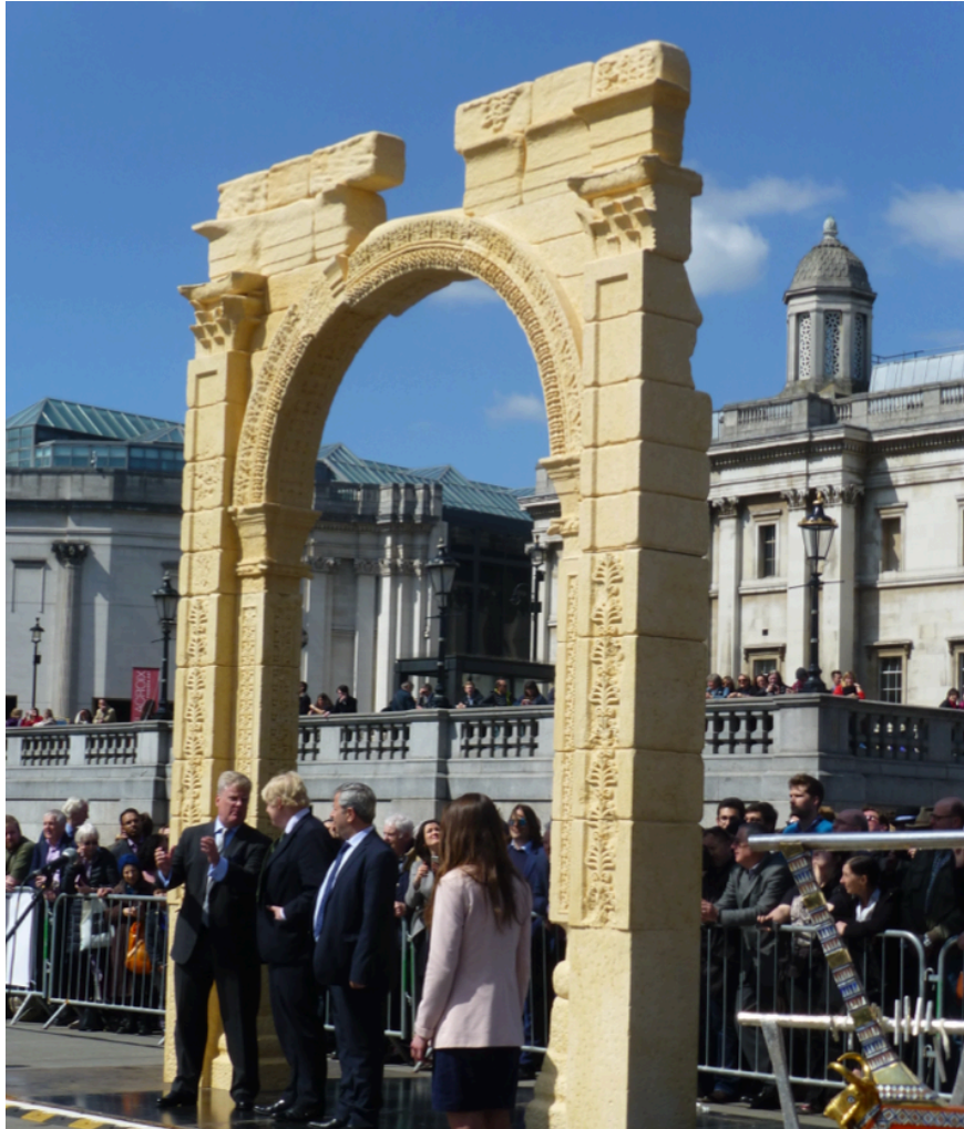
Figure 5. Inauguration of the Institute for Digital Archaeology's Arch of Palmyra (Source: Dr Zena Kamash FSA, April 19, 2016).

from all over the world, is ‘the crossroads of humanity, and that was what Palmyra was’ (cited in Murphy, 2016).