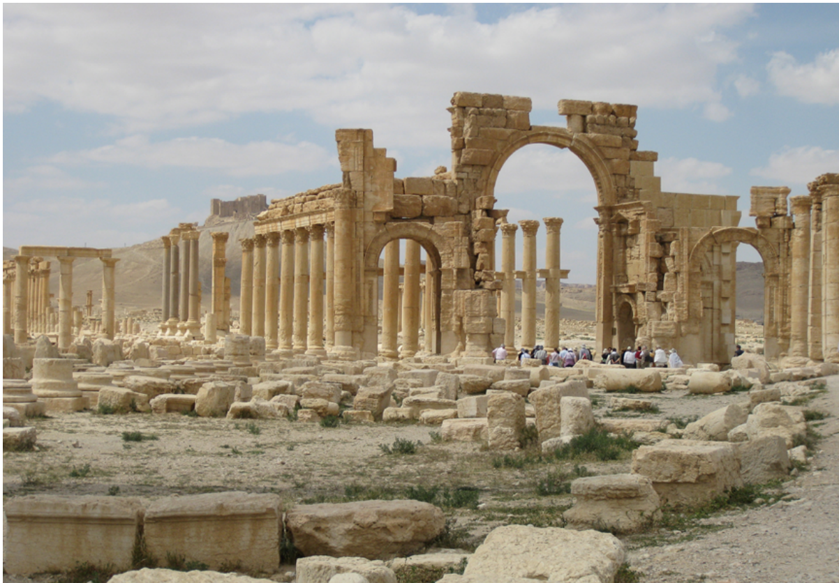
Figure 1. Palmyra – Monumental Arch – south side.