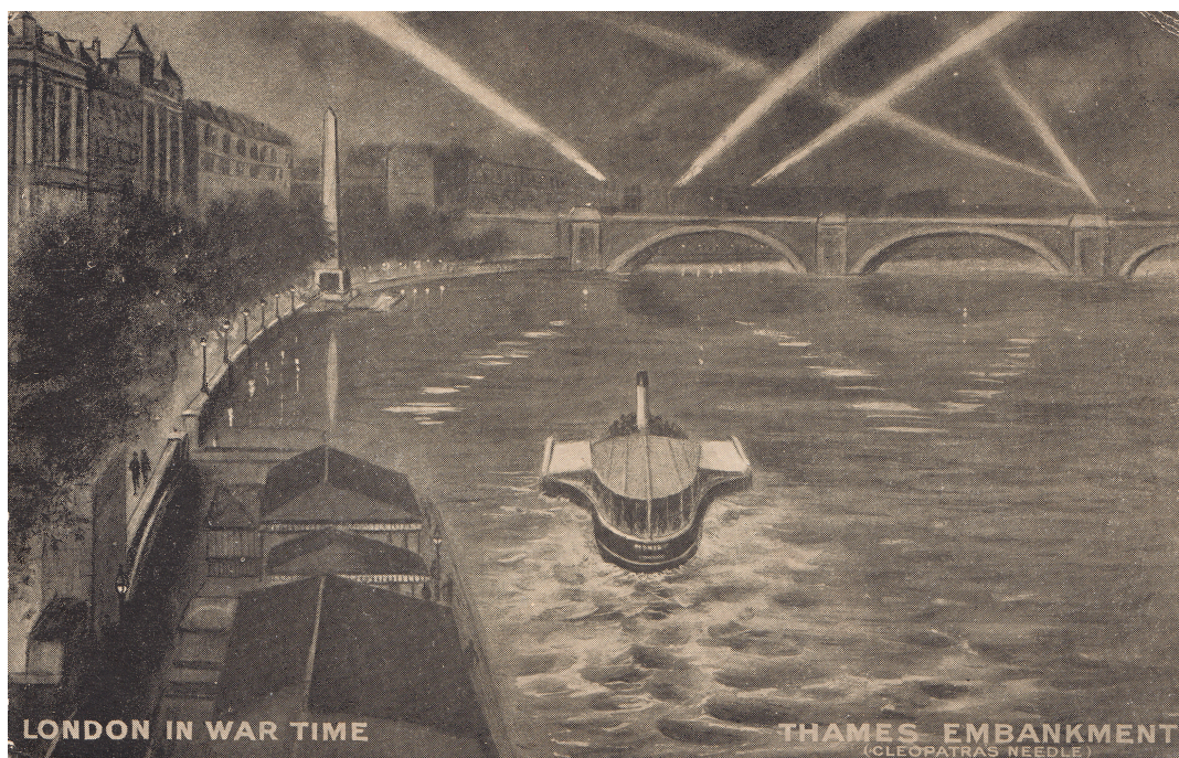
Figure 6. London in War Time: Thames Embankment (Cleopatra’s Needle).