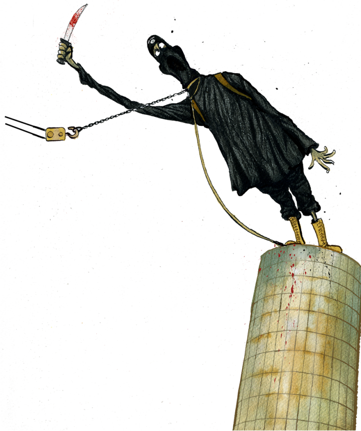
Figure 7. Isis's last stand (Source: Morten Mørland / The Spectator , February 18, 2017).